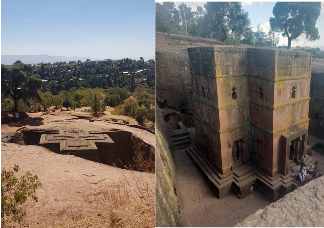
Figure 5: Morgan Ellsworth. Church of Saint George . Lalibela, Ethiopia. Taken 01/2020.