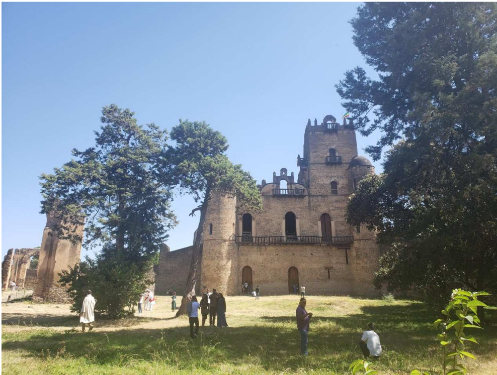
Figure 8: Morgan Ellsworth. Emperor Fasilidas' Castle . Gondar, Ethiopia. Taken 01/2020.